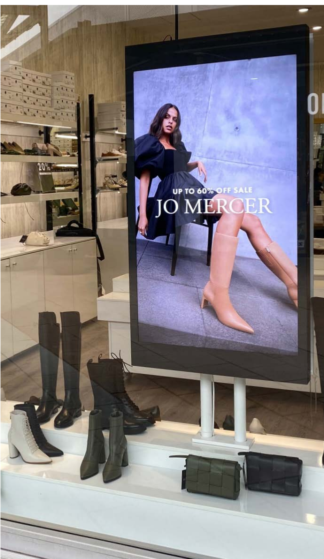
Dual Pole Frame Design built into existing Window Display Jo Mercer Harbour Town, SA