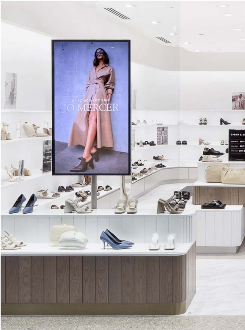
Single Pole Floor Mounted Design built into existing Window Display

MDH is now a SONIQ Cybercast distributor Australia-wide. MDH supply and install all SONIQ Cybercast products including TV window displays and window wall displays.