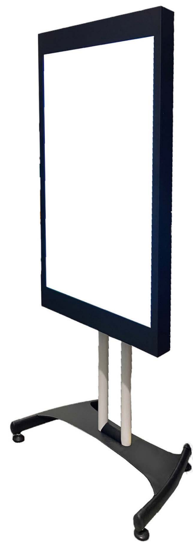
Dual Pole Base Frame Design

Installation includes base stabilisation plates, as per engineering drawings.