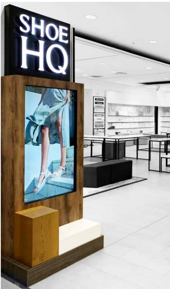
Example Freestanding Design (Custom Built)

Fitted using robust wall mount brackets, as provided by supplier.