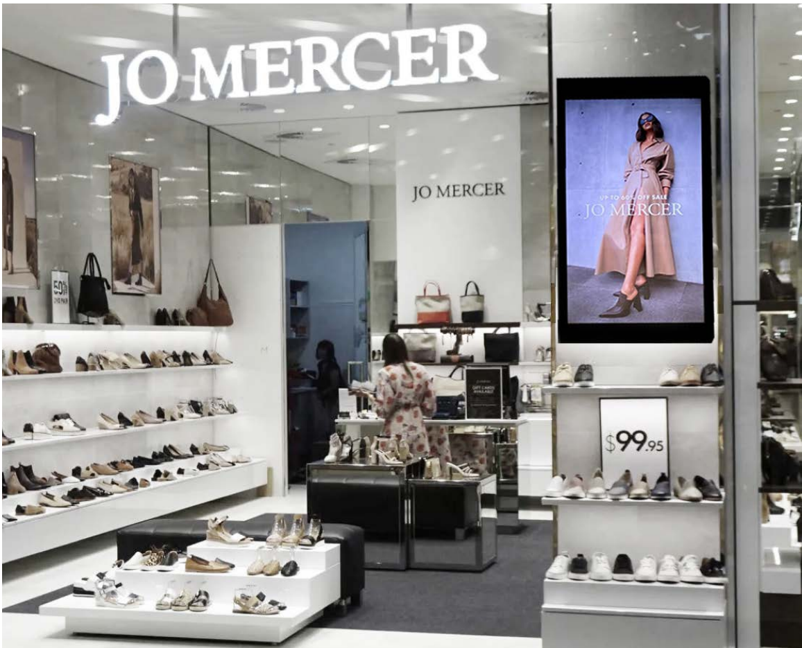
Proposed Wall Mount Design / Jo Mercer Marion

Fitted using robust wall mount brackets, as provided by supplier.