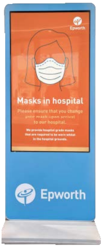
*Company Logo Print Option