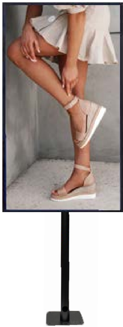
Single Pole Floor Mounted Design

Fully Engineered to Australian Standards