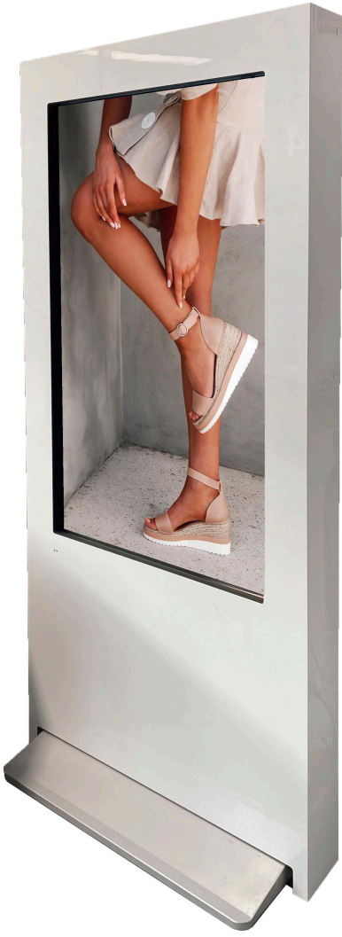
Freestanding Design in White Frame