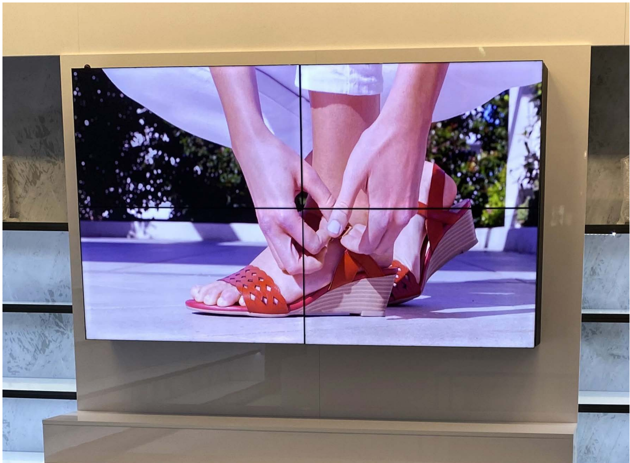
4 Panel Multi Screen Wall Mounted Design